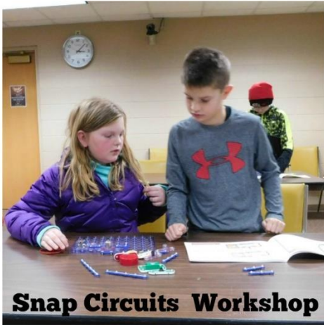
Snap Circuits Workshop