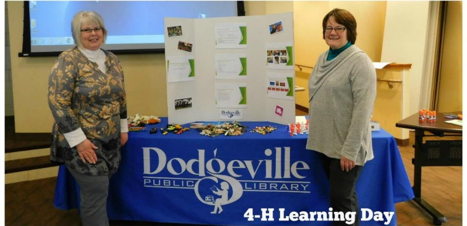
4-H Learning Day