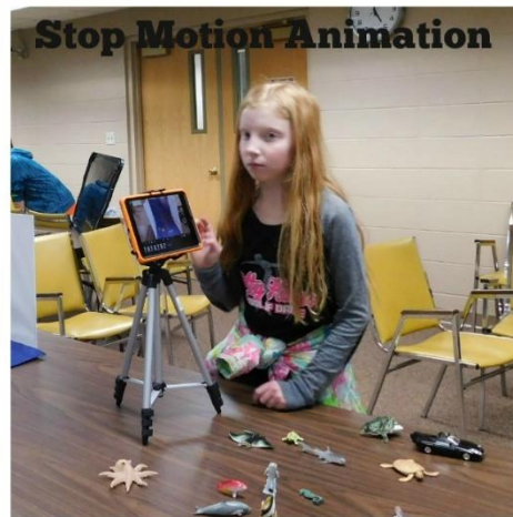
Stop Motion Animation