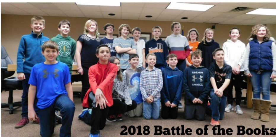
2018 Battle of the Books