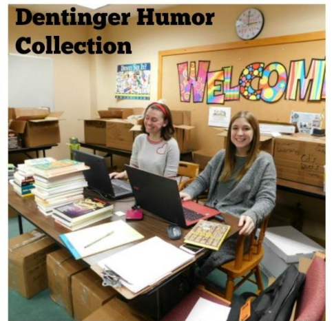
Dentinger Humor Collection